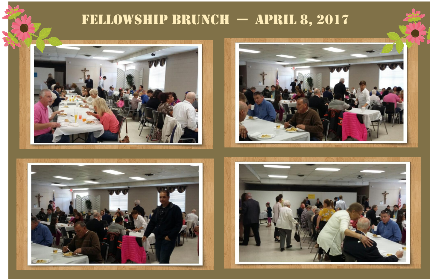
FELLOWSHIP BRUNCH — APRIL 8, 2017