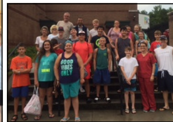
Fun at Cullman Aquatics!